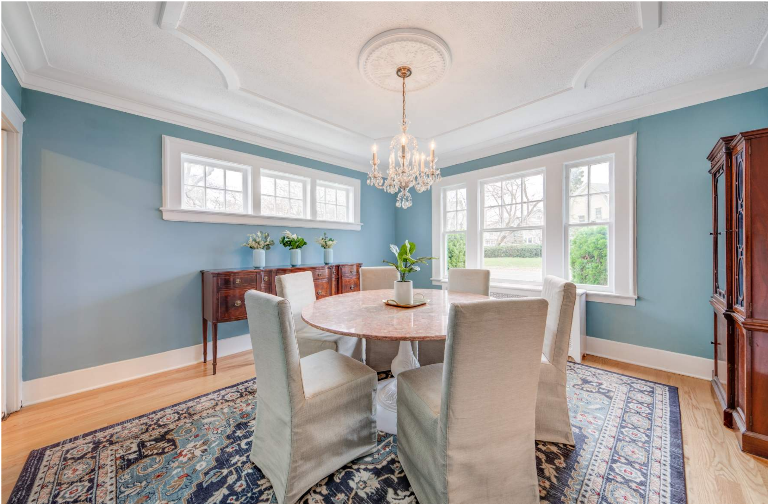
Welcome to 345 Prospect Street, the perfect blend of vintage charm and modern amenities tied into one. Beautifully situated on a magical tree-lined street, you'll find this exquisite 6 Bedroom, 3 ½ Bath South Orange stunner renovated to perfection. With fabulous open floor plan, superb craftsmanship and finishes throughout, 345 Prospect Street hits all the right notes.