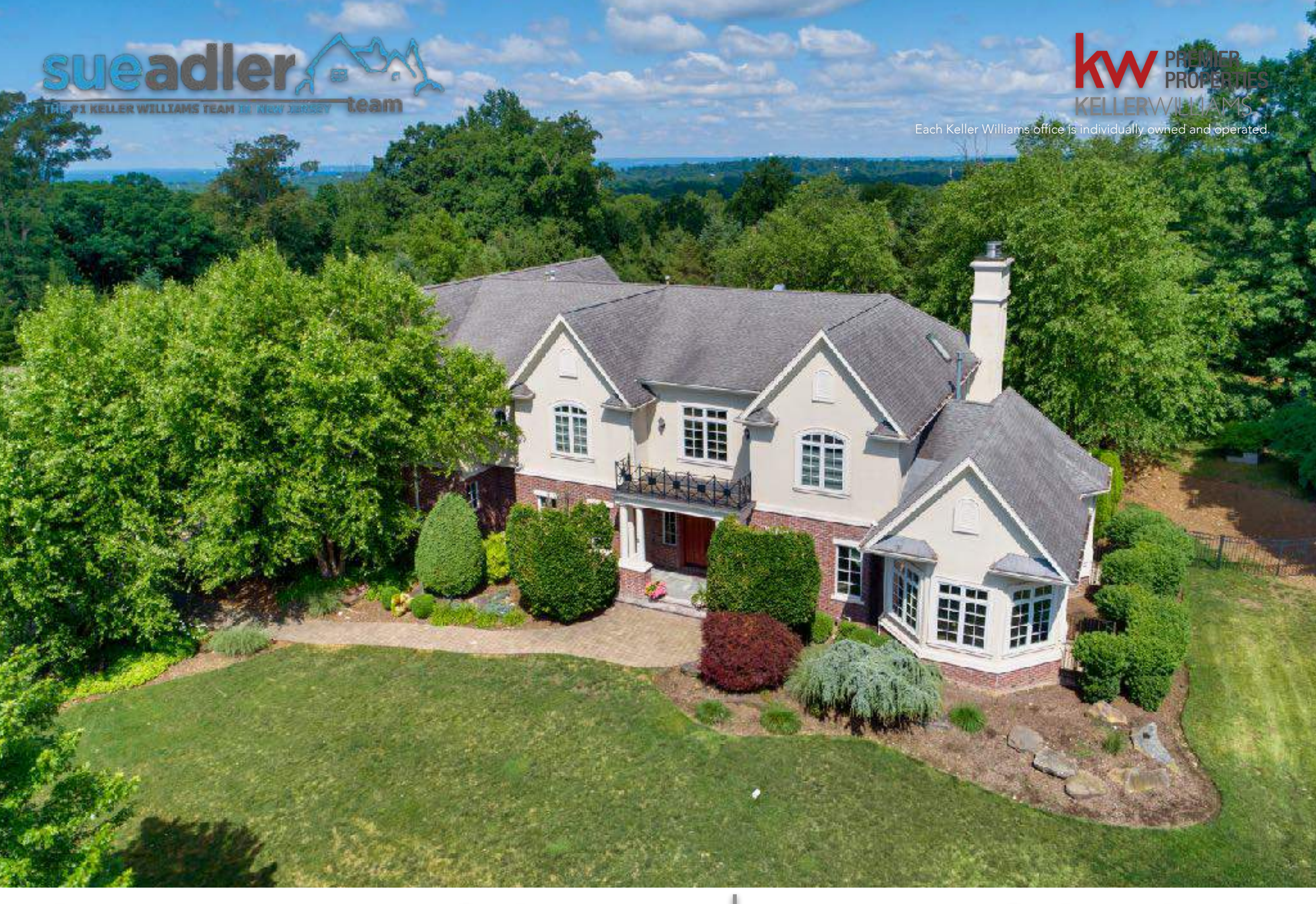
ONE KEAN COURT | LIVINGSTON