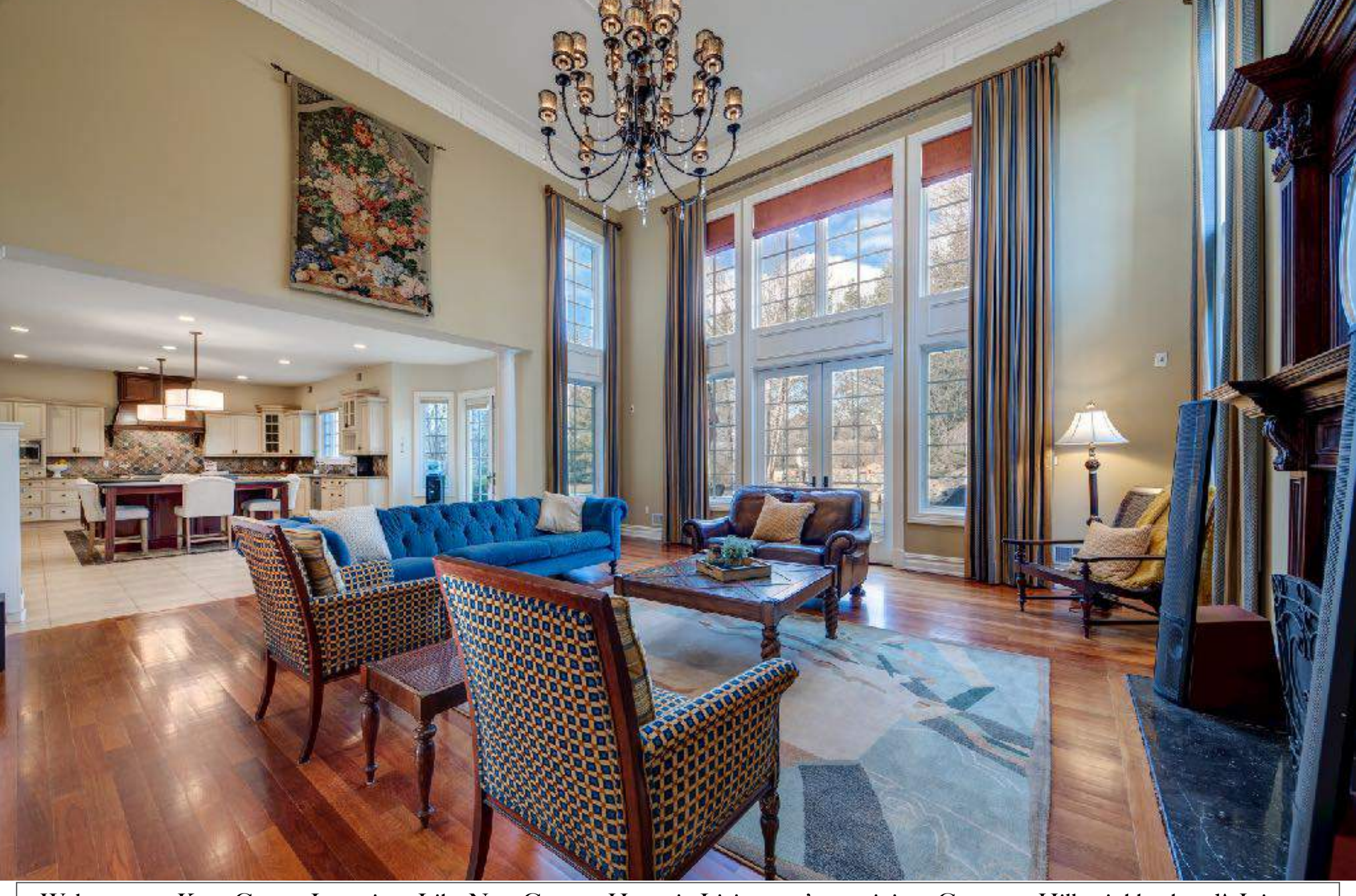
Welcome to I Kean Court - Luxurious Like New Custom Home in Livingston's prestigious Governor Hill neighborhood! It is not every day that a home this exceptional and elegant comes on the market. Move right in to this warm and welcoming 6 Bedroom, 6\frac{1}{2} Bathroom home with a seamless open floor plan, soaring ceilings and high end finishes at every turn. Simply put, this home is a model of absolute perfection.